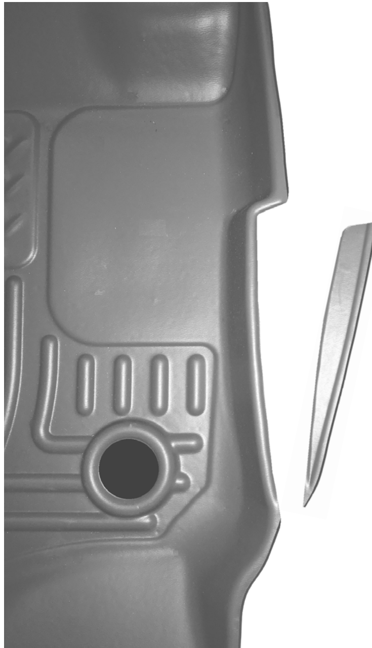
IMAGE SHOWING LINER TRIMMED FOR MANUAL TRANSFER CASE SHIFTER HOUSING. USE THE STEP CREATED BY THE RECESSED SECTION OF LINER AS YOUR TRIMMING GUIDE.

THE DRIVER'S SIDE LINER WILL ACCOMMODATE A FACTORY FLOOR MOUNT 4X4 SHIFTER VIA TRIMMING. TO TRIM, USE THE STEP CREATED BY THE LOWERED AREA ON THE PART THAT CORRESPONDS WITH THE SHIFTER. SEE THE BACK OF THIS PAGE FOR MORE DETAIL.