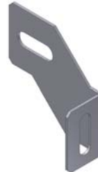
#5 MOUNTING BRACKET