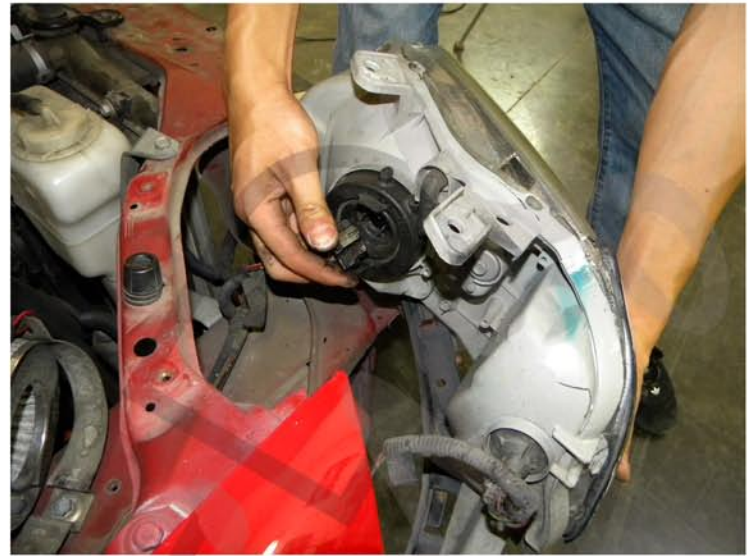
12. Unplug the harness