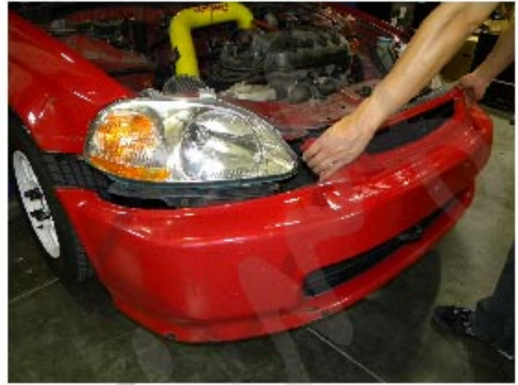
6. Remove the front bumper