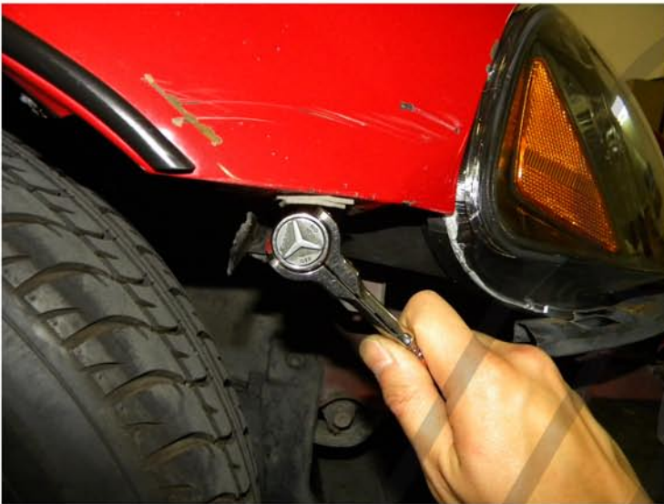
19. Tighten outer 10mm bolt