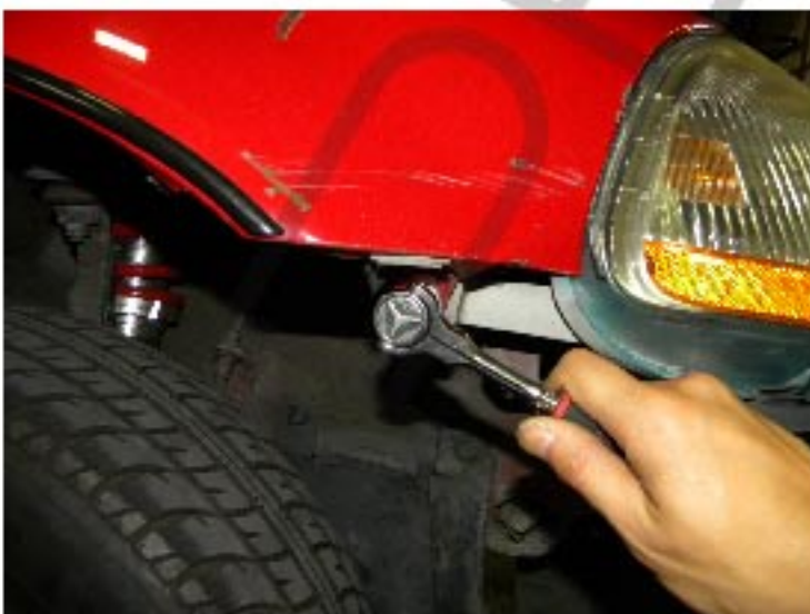
9. Remove 10mm bolt from the corner of headlight