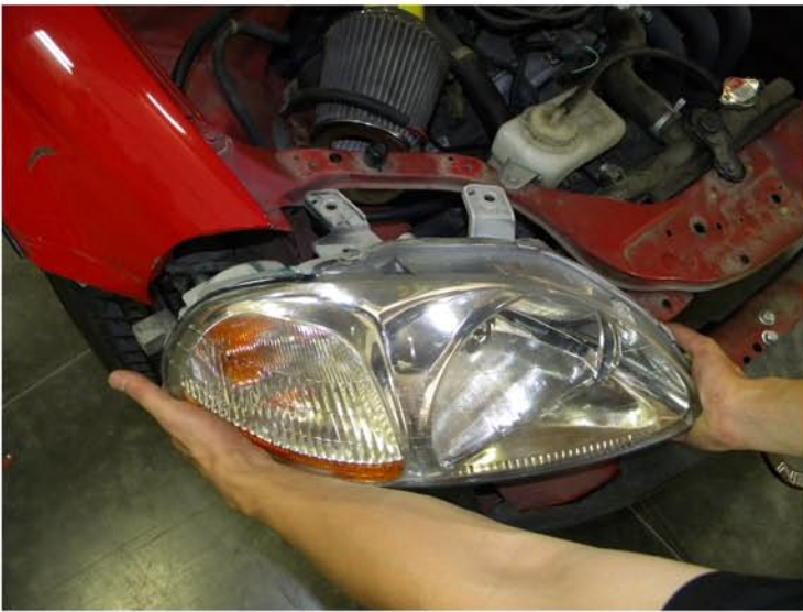
11. Pull out the headlight