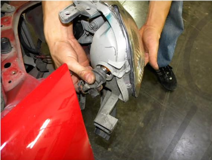
13. Unplug the light socket