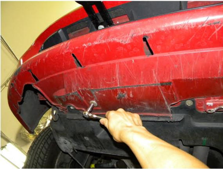
24. Tighten two 10mm bolts