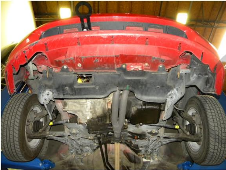
1. Remove all the 10mm bolts from the bottom of the bumper

If you experience any difficulties that the instruction did not cover, Please seek local auto shop for advise. Please wear protection before you work on your vehicle. An assistant is helpful when removing the front bumper. Please be careful while working with the bumper or body part to avoid scratching. Do not make direct contact with the halogen bulb or the wire assembly until the unit has cooled down after use.