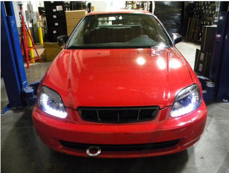
26. The installation is now complete