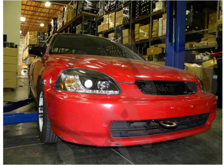
25. Please repeat the picture order from 1 to 25 for the opposite side