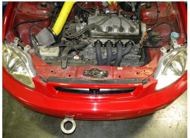
4. Top of bumper, there are seven clips