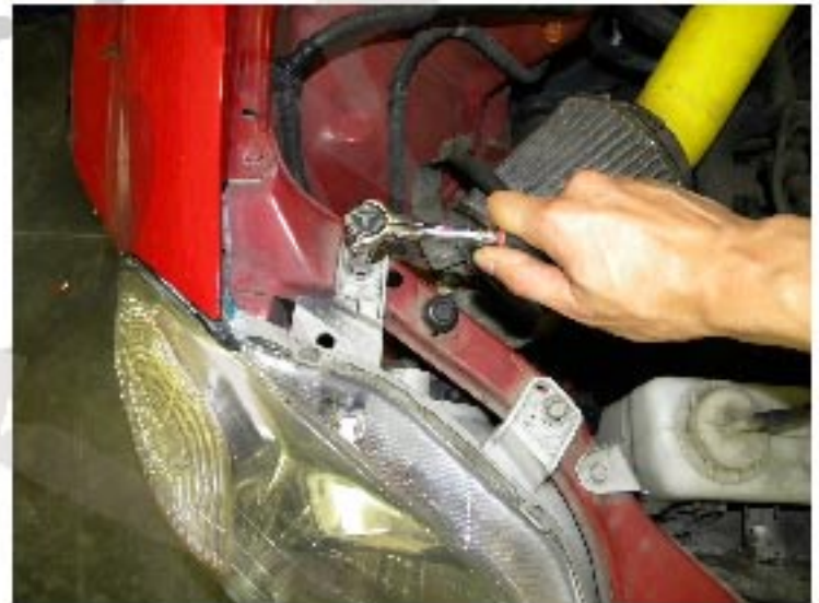
8. Remove the other 10mm bolt