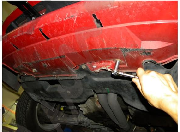
2. Demonstration in the picture above