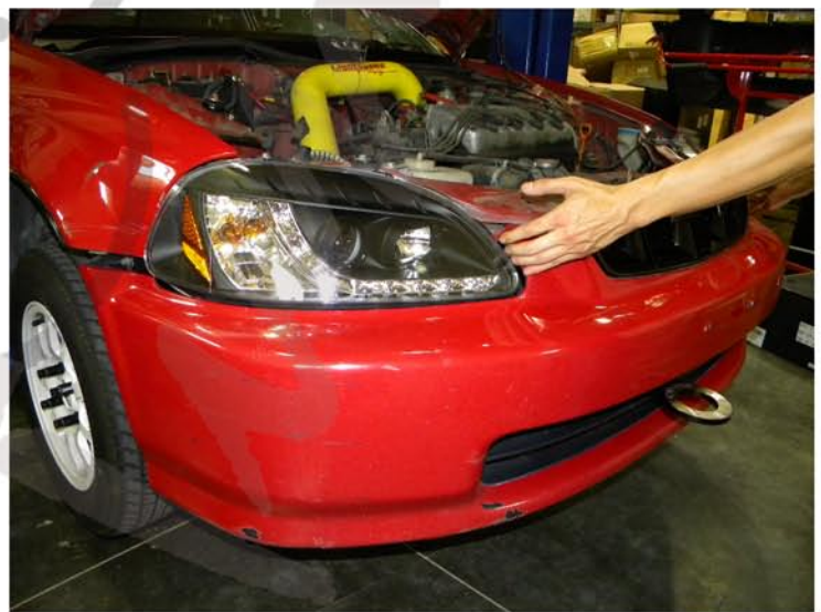
20. Replace the front bumper