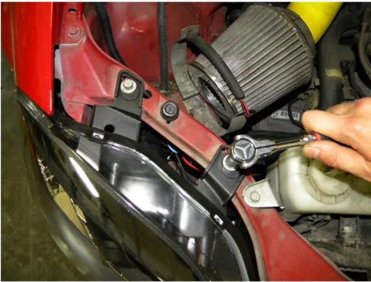
17. Tighten top two 10mm bolts