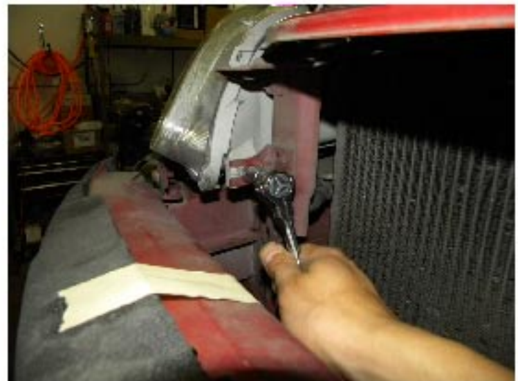
10. Remove the 10mm bolt near the radiator