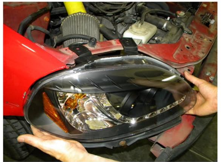
16. Place Projector headlight in place Please see the Halo and L.E.D installation instruction If your headlights don't have HALO or L.E.D. You can skip it