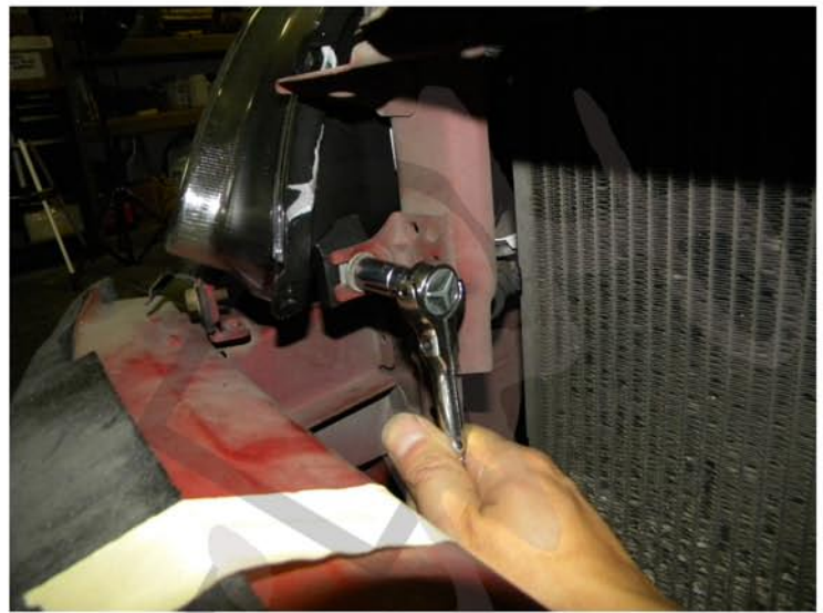
18. Tighten inner 10mm bolt