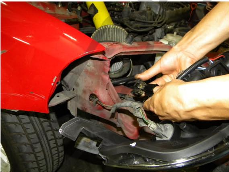
15. Plug in the harness