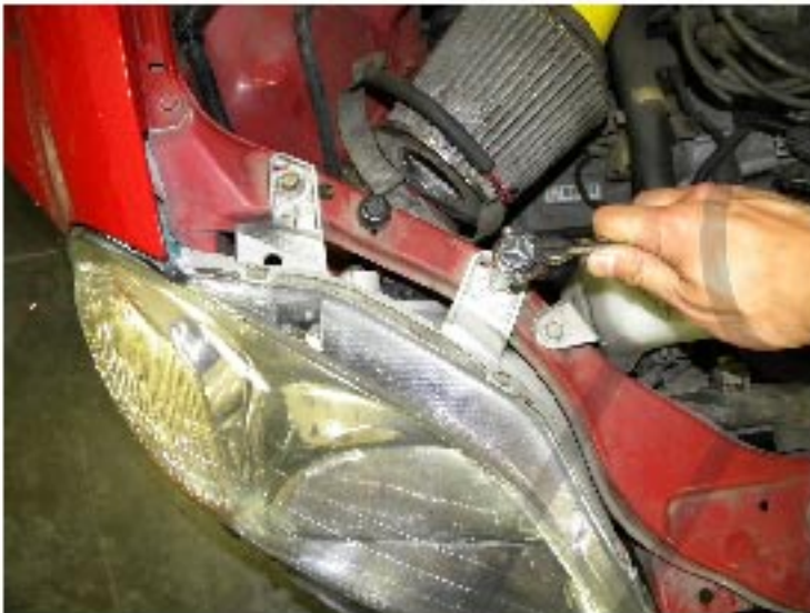
7. Remove the inner 10mm bolt