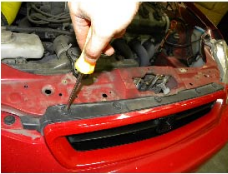
5. Remove seven plastic clips