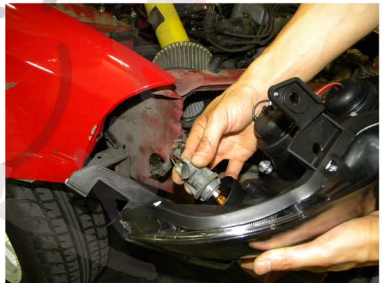
14. Plug in the light socket