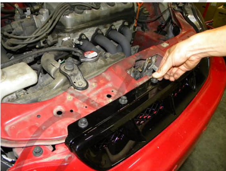
21. Replace the seven plastic clips