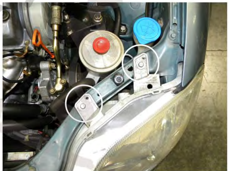
8. Bolt locations above headlight