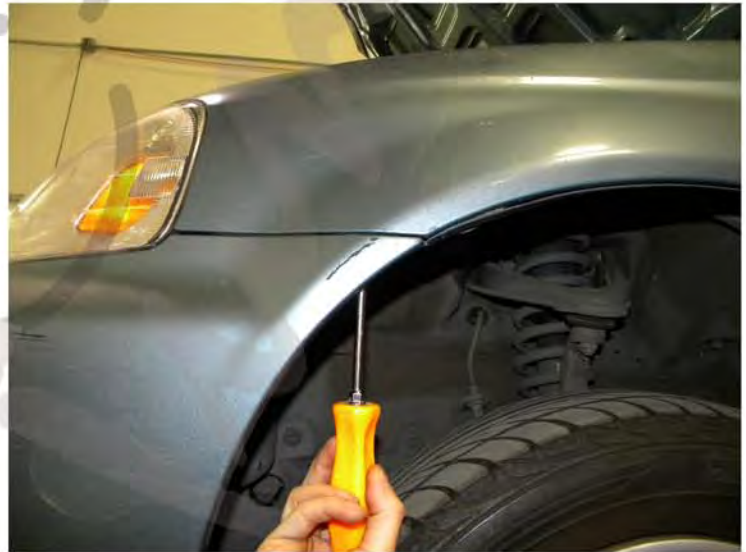
26. Screw in the phillips head screw