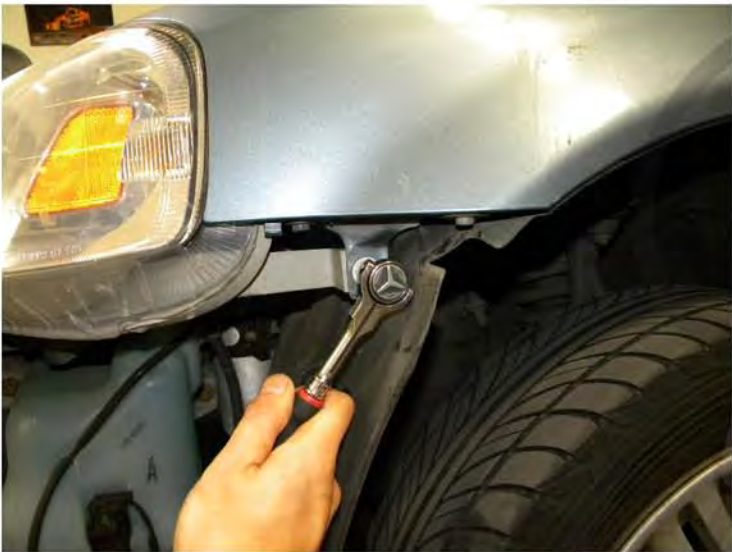
13. Remove the 10mm bolt