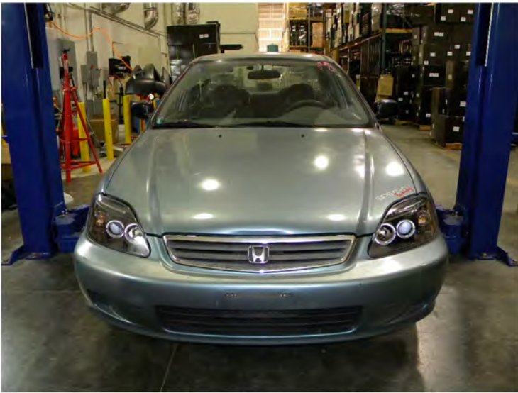
29. Please repeat the steps from 1 to 28 for the opposite side