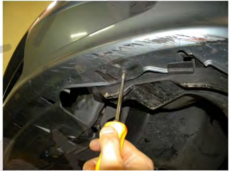
2. Unscrew (2) phillip head screw