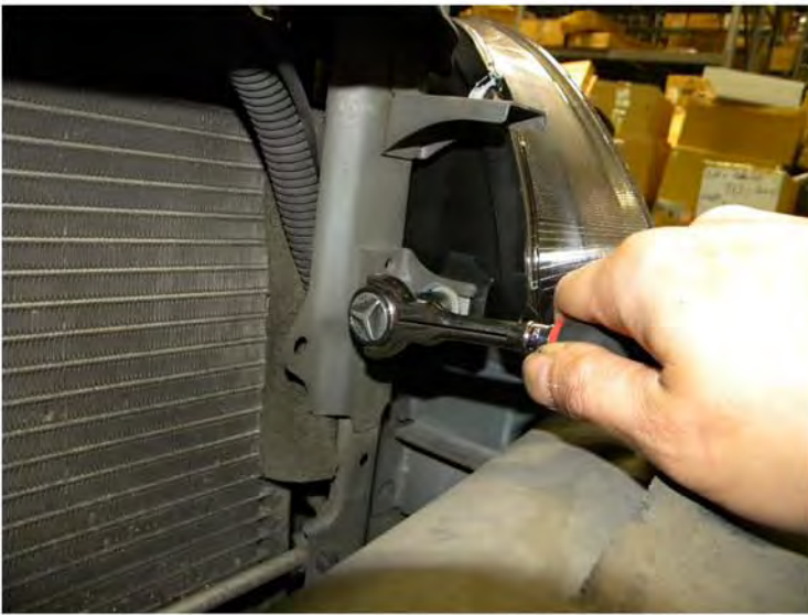
23. Tighten the 10mm bolt on the inner corner of the headlight