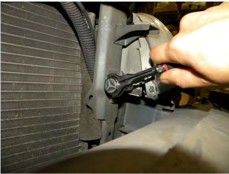
11. Remove the 10mm bolt on the inner end of the headlight