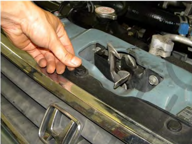
25. Replace the (7) clips