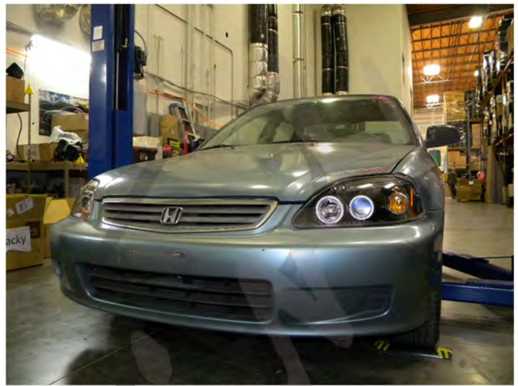
30. The installation is now complete