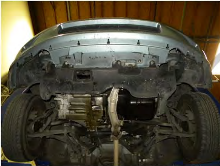
1. Under the front bumper

If you experience any difficulties that the instruction did not cover, Please seek local auto shop for advise. Please wear protection before you work on your vehicle. An assistant is helpful when removing the front bumper. Please be careful while working with the bumper or body part to avoid scratching. Do not make direct contact with the halogen bulb or the wire assembly until the unit has cooled down after use.