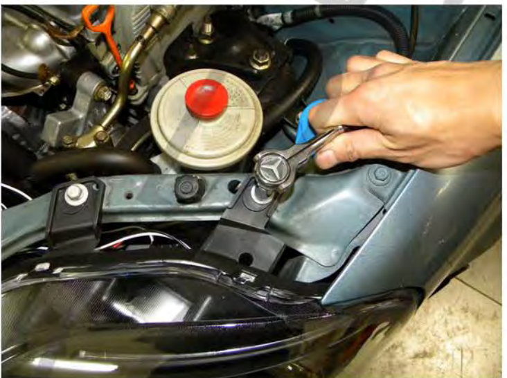
21. Tighten the second 10mm bolts