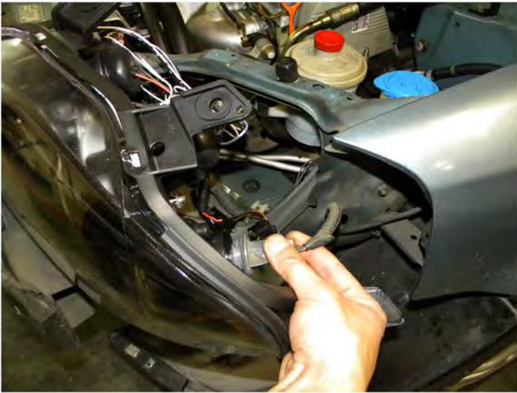
17. Plug in the light socket