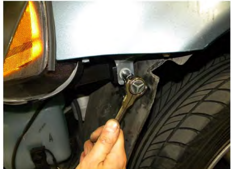
22. Tighten the 10mm bolt on the outer corner of headlight'