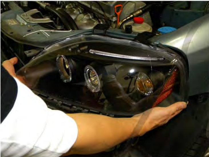
19. Place the projector headlight

Please see the Halo and L.E.D installation instruction If your headlights don't have HALO or L.E.D. You can skip it