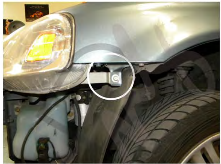
12. Outer 10mm bolt location