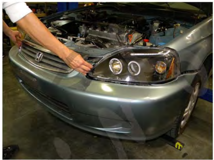
24. Replace the front bumper