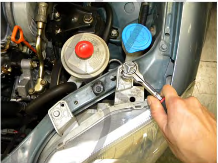
9. Remove (2) 10mm bolts