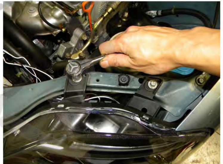
20. Tighten two 10mm bolts