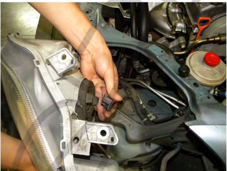
15. Unplug the light harness