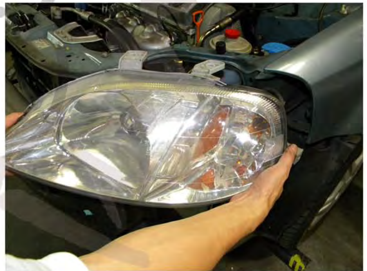
14. Pull out the headlight