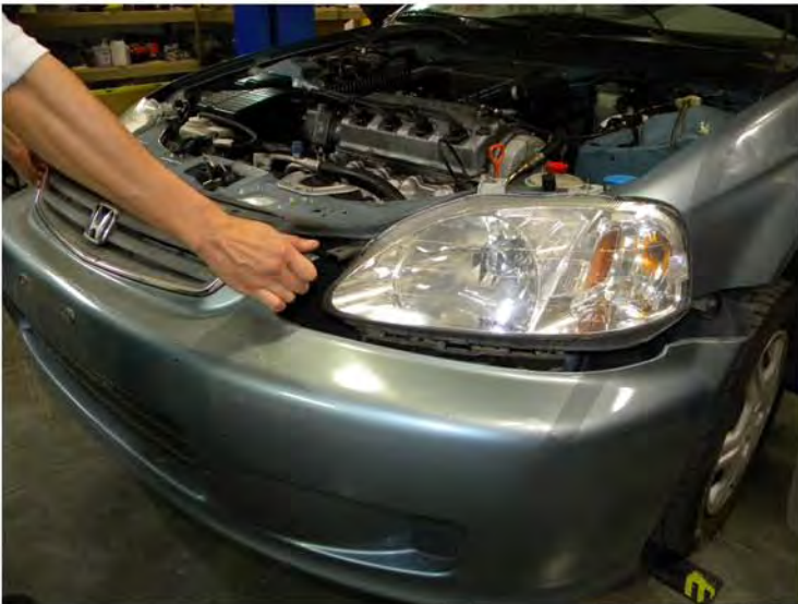
7. Remove the front bumper