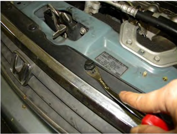
5. Remove (7) Clips from the top of the front bumper