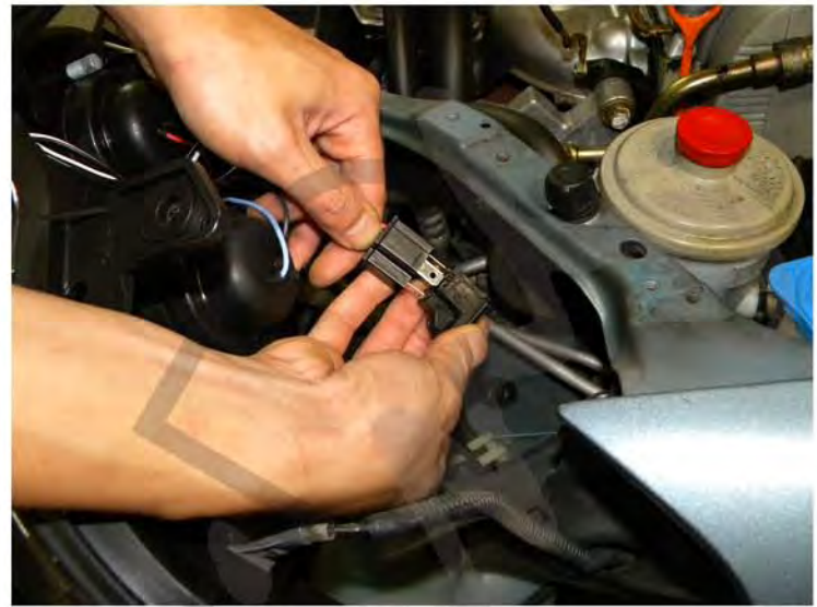
18. Connect the light harness

Please see the Halo and L.E.D installation instruction If your headlights don't have HALO or L.E.D. You can skip it