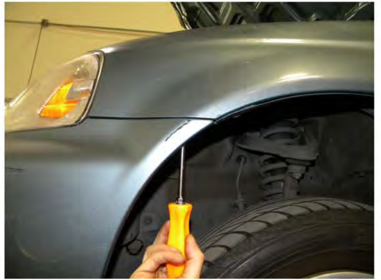
4. Unscrew a phillips head screw