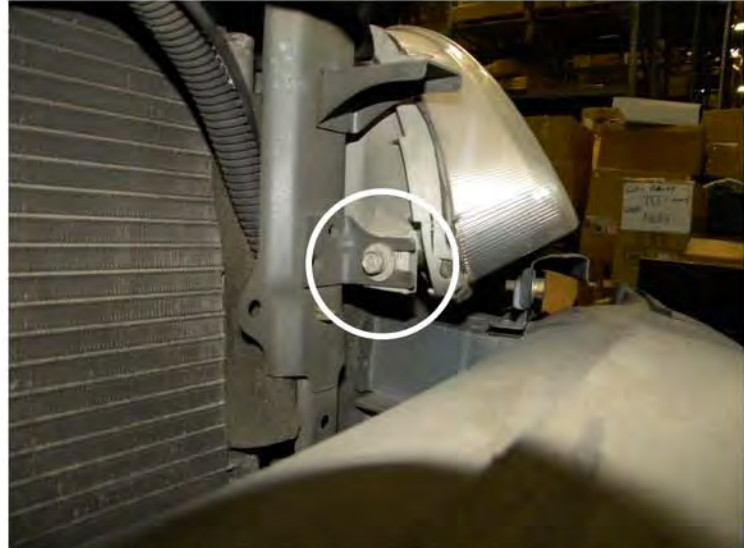
10. Inner 10mm bolt location