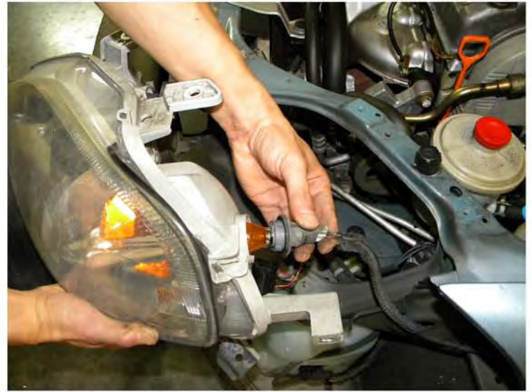
16. Unplug the light socket