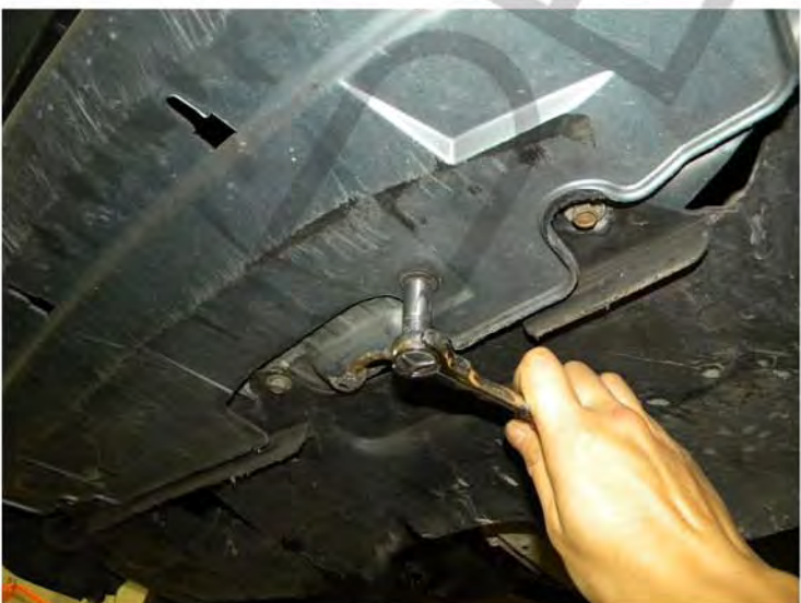
27. Tighten (2) 10mm bolts under front bumper