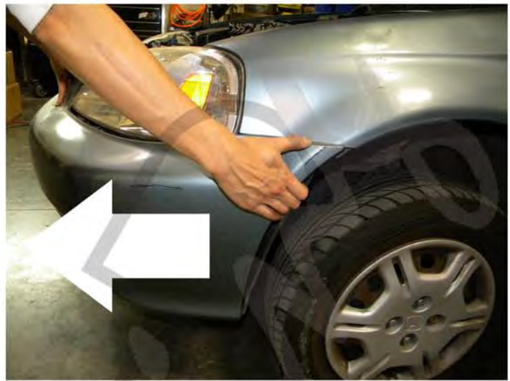
6. Pull the sides of the bumper