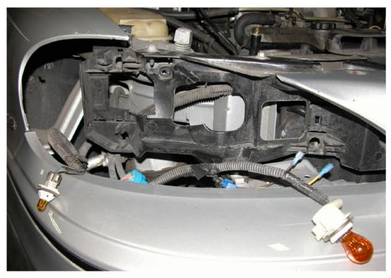
17. After you modify the area, it should look same as the picture shown above