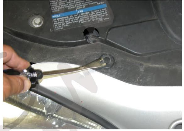
2. Remove the clips