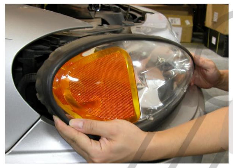
7. Gently pull out the headlight slightly, just enough to see the back of the light