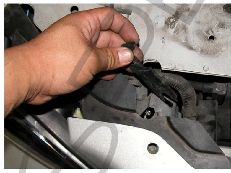
21. Then push the inner latch back into place