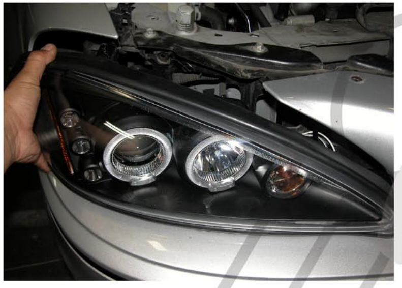
19. Gently install the headlight to its original spot