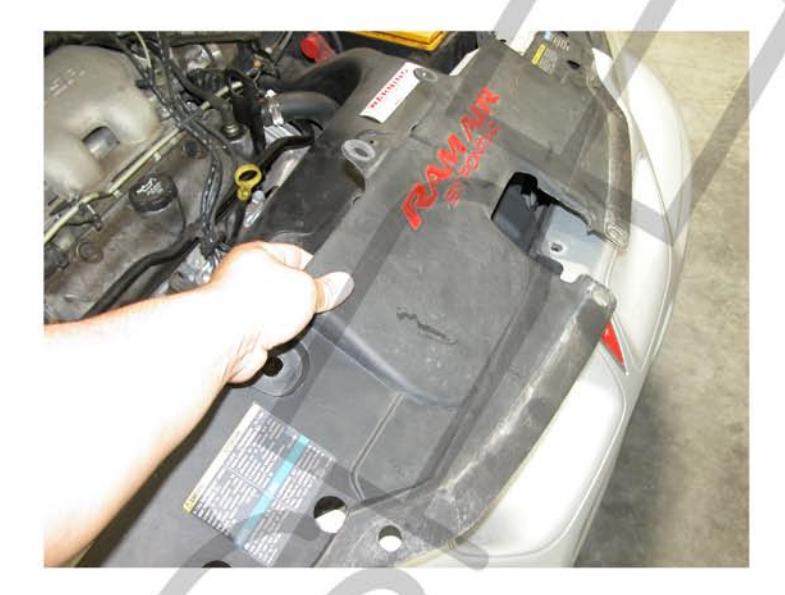
3. Then remove the plastic cover