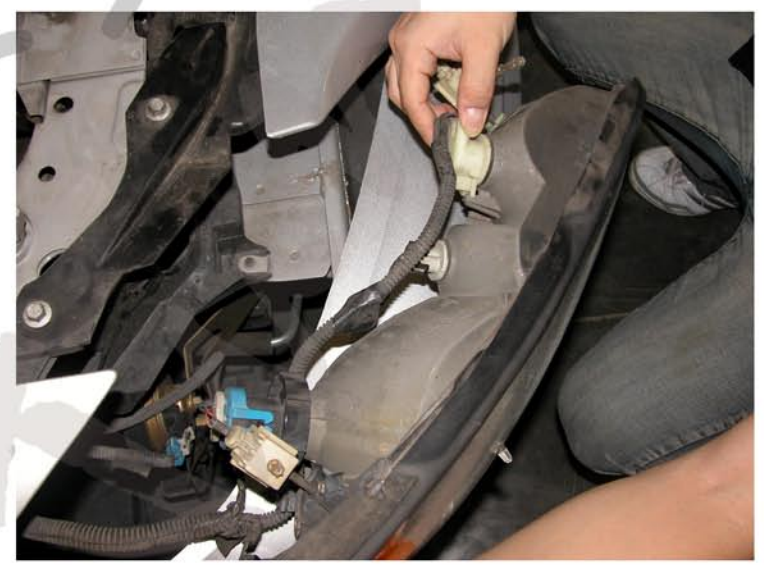
8. Disconnect all the connectors and remove the headlight