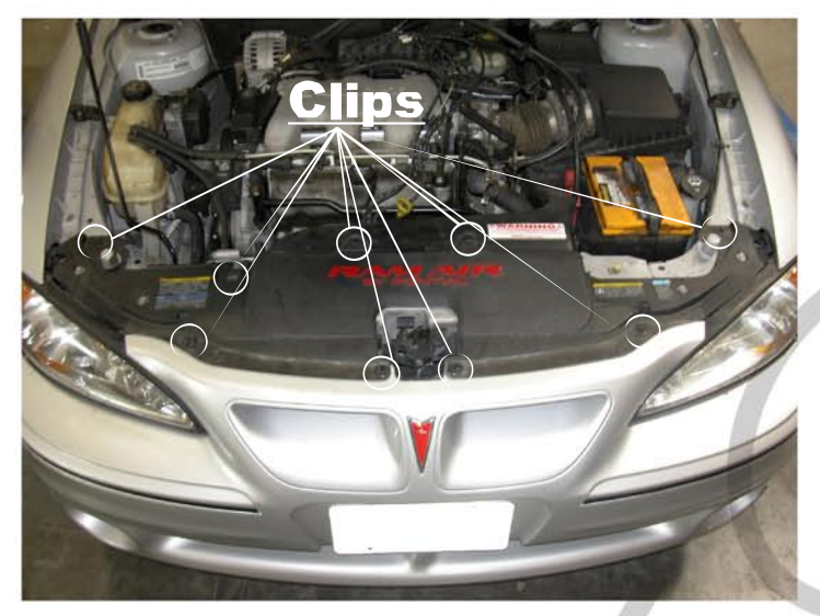
1. Open the hood