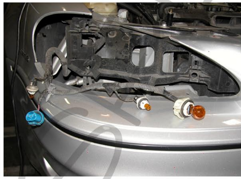
9. After you remove the headlight, it should look the same as the picture shown above