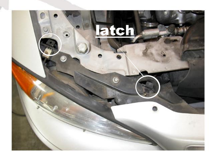
4. There are two latches