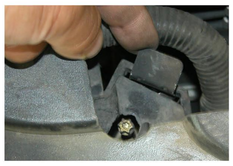
5. Pull the inner latch out first