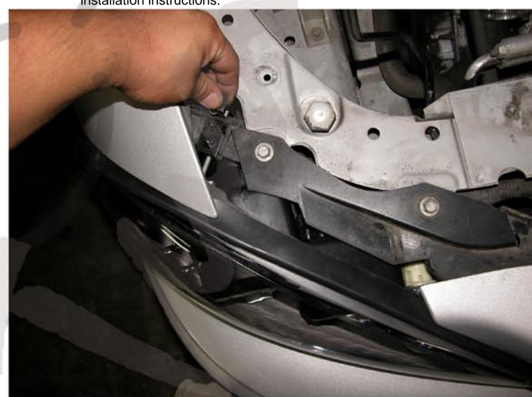
20. Push the outer latch back into place