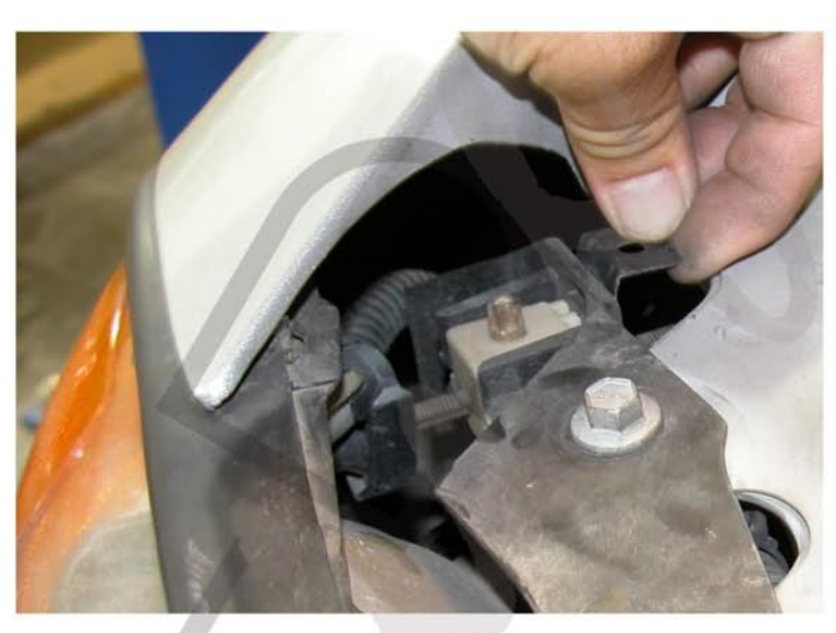
6. Then pull the outer latch up