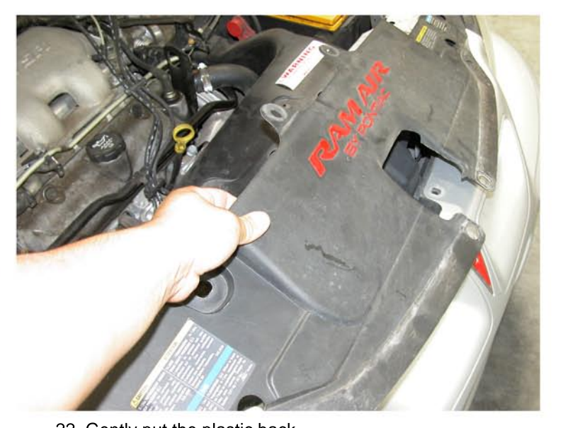
22. Gently put the plastic back

( Please repeat the picture order from 1 to 22 for the opposite side)