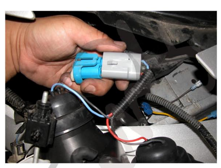
18. Connect the harness from the headlight please see the "Halo and L.E.D. installation instructions" If your headlights don't have HALO or L.E.D. You can skip the installation instructions.