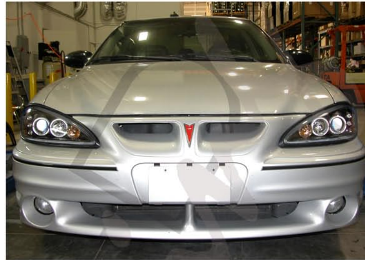
23. The installation is now complete