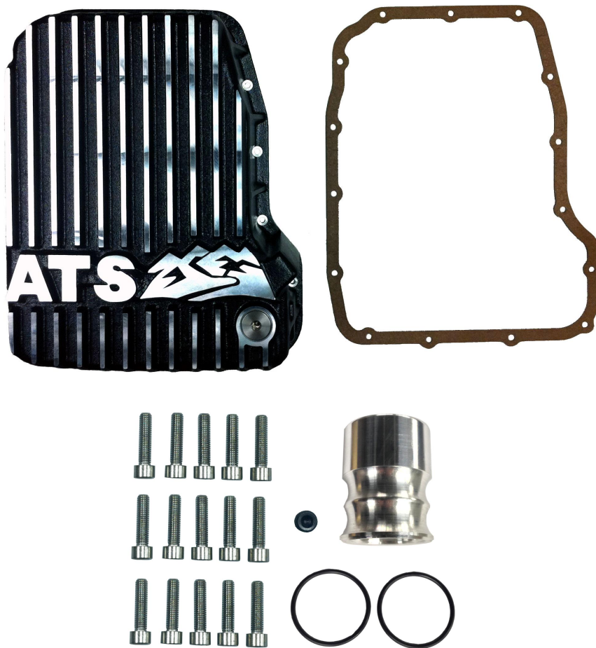
Figure 1 - 68-RFE Deep Pan Kit Contents

Please read all instructions before installation.