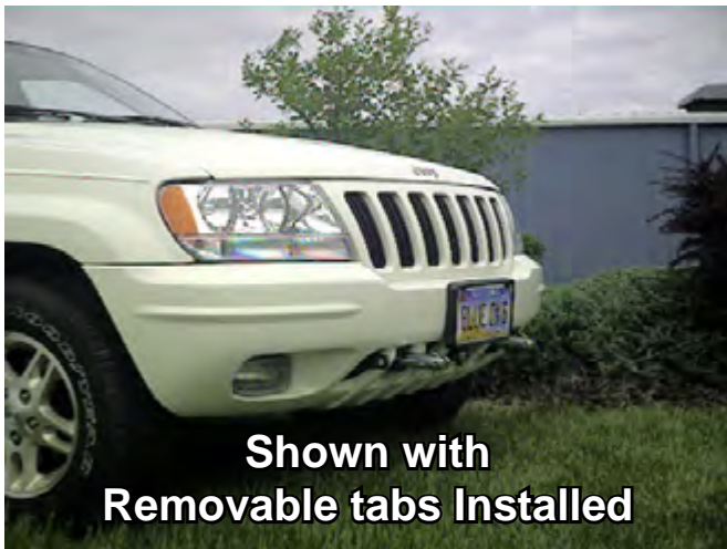
Shown with Removable tabs Installed

Again, thank you for being our customer and for the confidence you have shown in the performance of our products. It is because of customers like you we enjoy the success we have today.