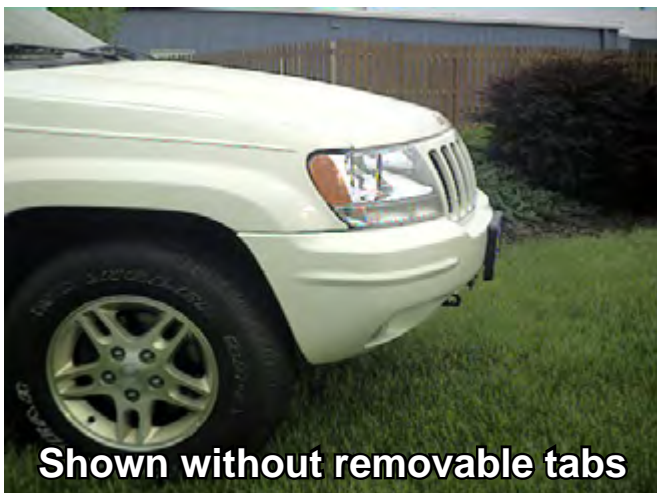
Shown without removable tabs