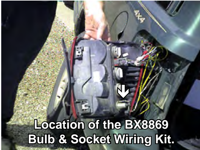
Location of the BX8869 Bulb & Socket Wiring Kit.