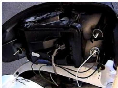
Location for the BX8869 on the passenger's side.