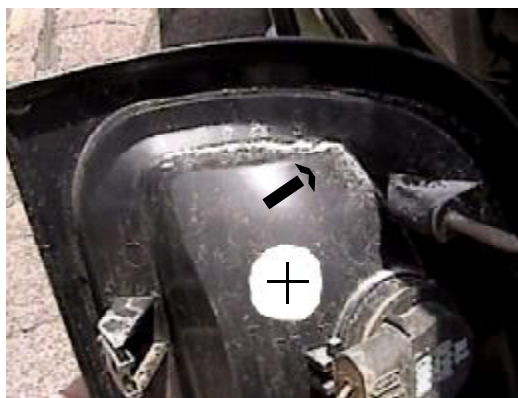
Location for the BX8869, view of driver's side tail light assembly.

IMPORTANT: Use only genuine factory replacement parts on your Base Plate. Do not substitute homemade or nontypical parts. If a bolt is lost or in need of replacement, for your safety and the preservation of your Base Plate, be sure to use a replacement bolt of the same grade (Usually Grade 5, refer to parts list). Repair parts may be ordered through your nearest Blue Ox dealer or distributor.