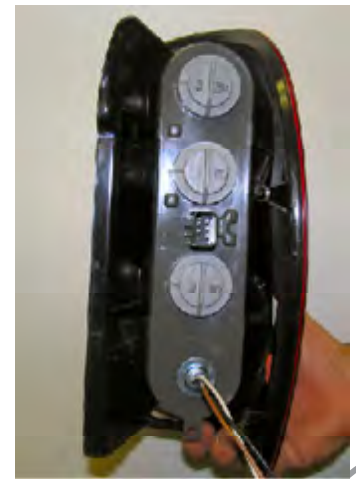
Location for the BX8869 on driver's side tail light assembly.

IMPORTANT: Use only genuine factory replacement parts on your Base Plate. Do not substitute homemade or nontypical parts. If a bolt is lost or in need of replacement, for your safety and the preservation of your Base Plate, be sure to use a replacement bolt of the same grade (Usually Grade 5, refer to parts list). Repair parts may be ordered through your nearest Blue Ox dealer or distributor.