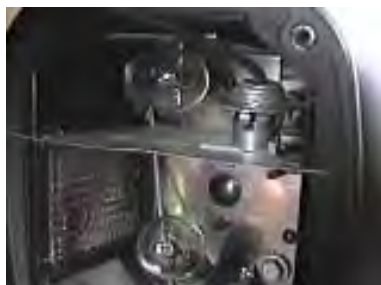
Location for the BX8869