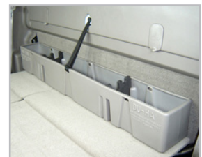
This is how the DU-HA should look installed behind the back seat.