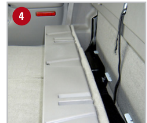
The DU-HA bolts to rear floor flaps to allow access to jack when tilted forward.