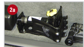
Remove wheel blocks from jack, then loosen jack.