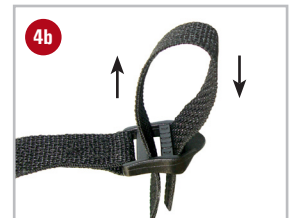
Ribs on buckle should face up. Thread strap through buckle as shown.