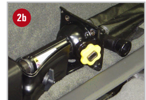
Rotate jack so yellow knob faces outward (as pictured).