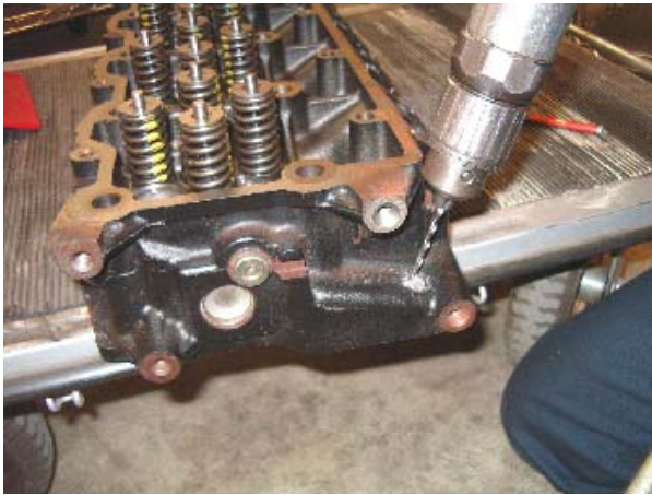
Drilling Pilot hole in Driver side Cylinder Head