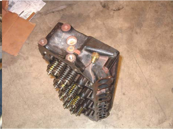
Finished Passenger Side