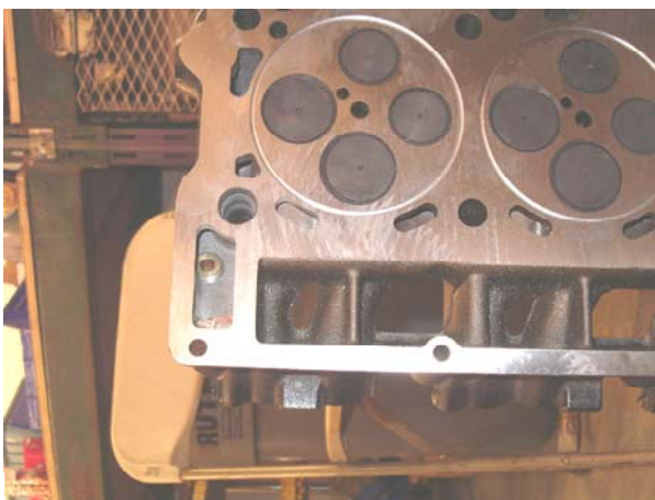
Fitting will be offset to water jacket port