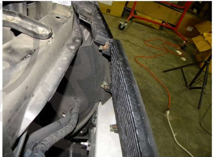
8. Phillips head screws location (8 total)