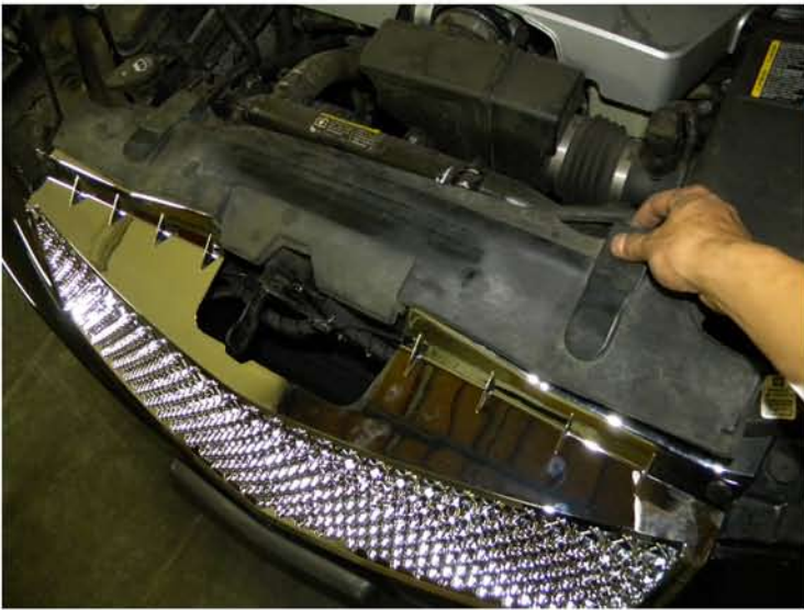
17. Replace the rubber guard