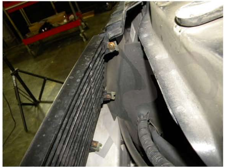
6. Phillips head screws location (8 total)