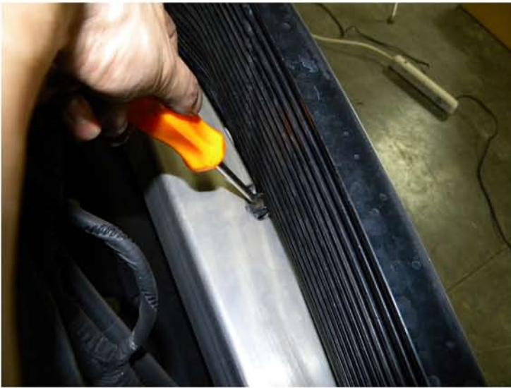
11. Remove the phillips head screws (8 total)