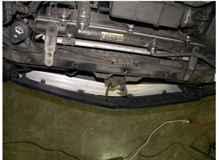
10. Phillips head screws location (8 total)