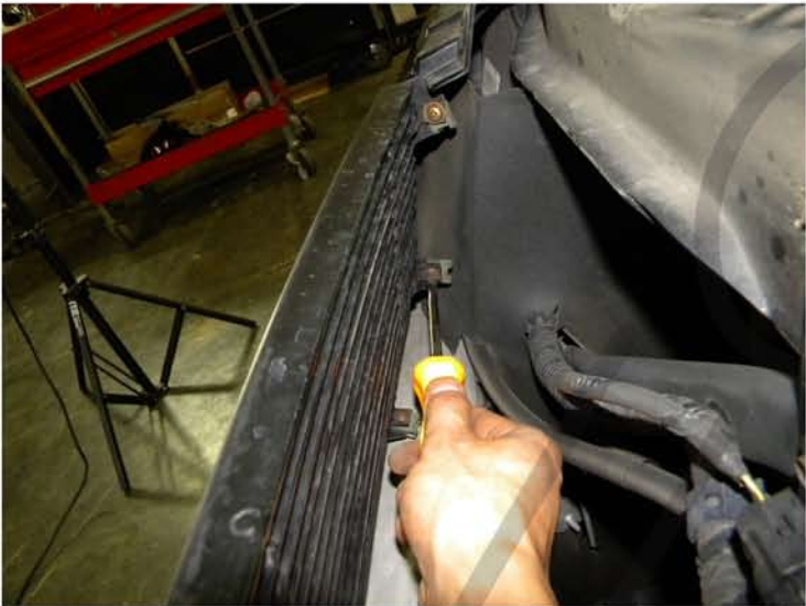
7. Remove the phillips head screws (8 total)