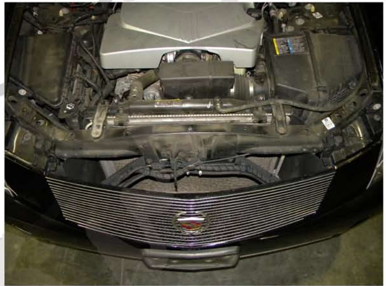
2. Plastic clip location