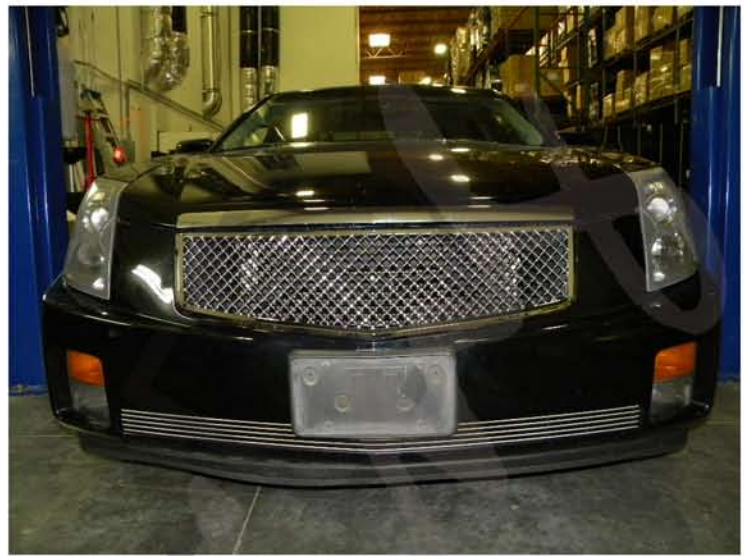
18. The installation is now complete