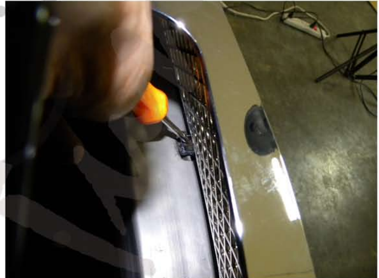
14. Replace and tighten the (8) phillips screws