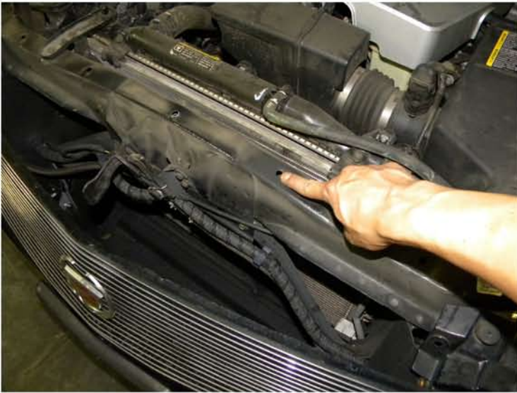
5. Remove the plastic clips on the top of the grill