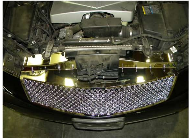
16. Plastic clips location