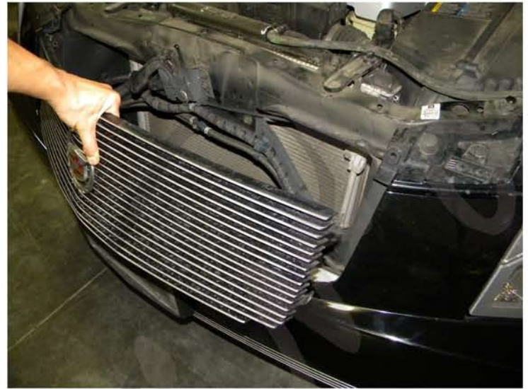
12. Remove the front grill