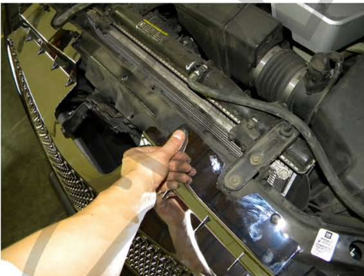
15. Place the (6) plastic clips on the top side of grill