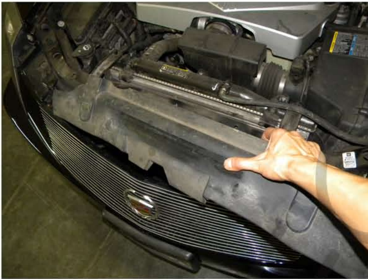
1. Remove the rubber guard

Do not make direct contact with the halogen bulbs or the wire assembly until the unit has cooled down after use.