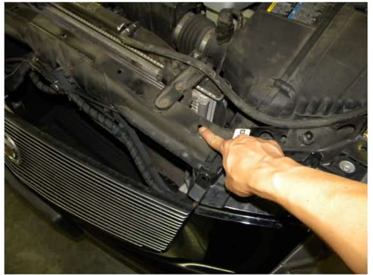
4. Remove the plastic clips on the top of the grill