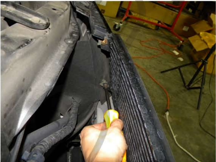
9. Remove the phillips head screws (8 total)