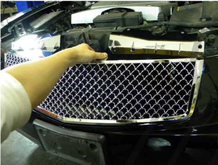
13. Place the new grill in the stock location