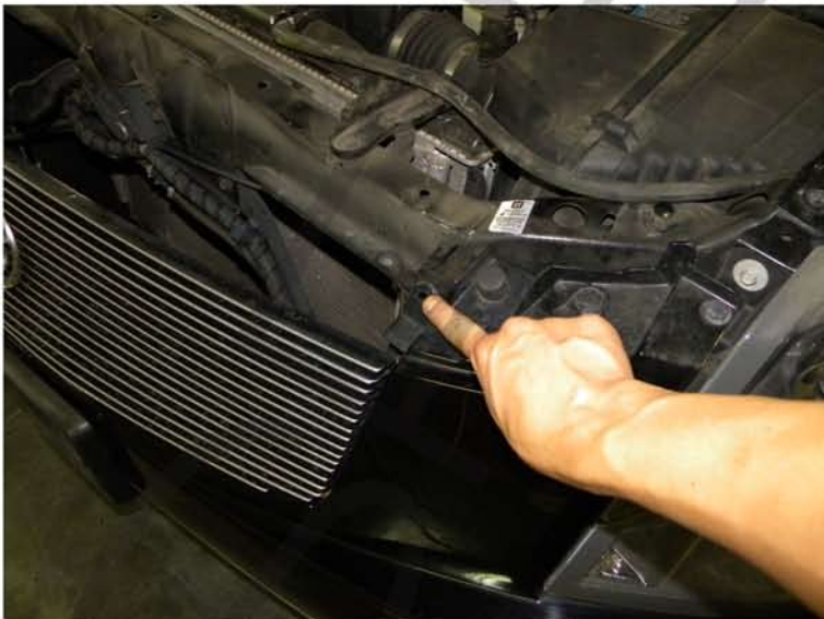
3. Remove the plastic clips on the top of the grill