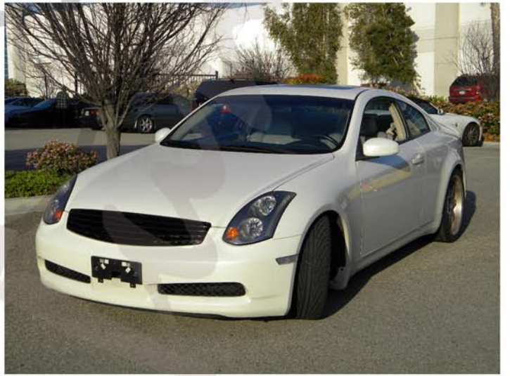
8. The installation is now complete