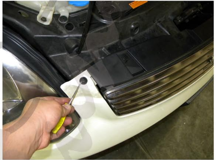
2. Remove the first clip from the left side (Both side)