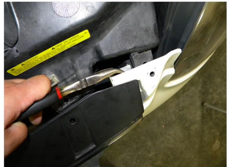
4. Unlock the one clip (Both side)