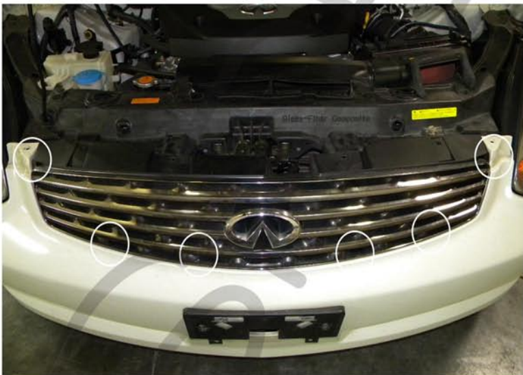
3. Unlock six clips from inside the front bumper