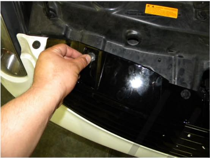
7. Install six clips