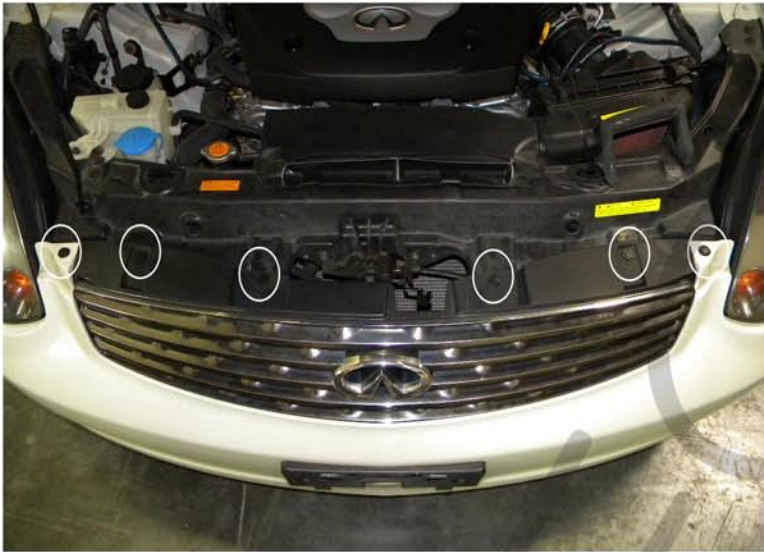
1. Remove six clips

If you experience any difficulties that the instruction did not cover, Please seek local auto shop for advise. Please wear protection before you work on your vehicle. An assistant is helpful when removing the front bumper. Please be careful while working with the bumper or body part to avoid scratching. Do not make direct contact with the halogen bulb or the wire assembly until the unit has cooled down after use.