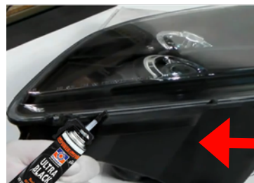
Seal it with Silicone