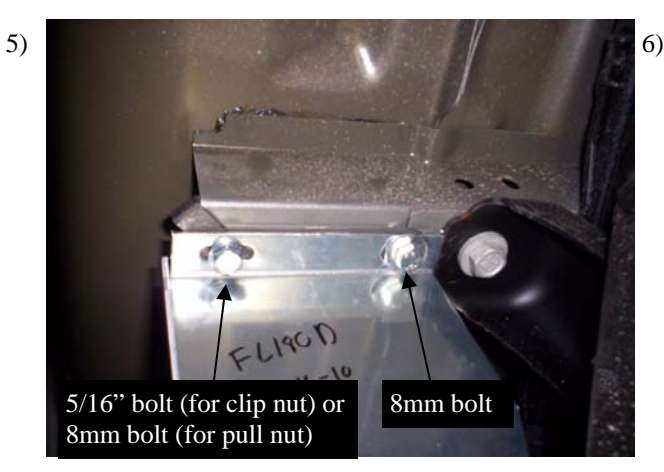
Install FL180D & P using 5/16" flanged bolt (for clip nut only) and 8mm bolt and washers, as in Fig. 5.

2007–C Chevy/GMC FS PU OC7438EX, OC7438EXB OC8438EX, OC8438EXB