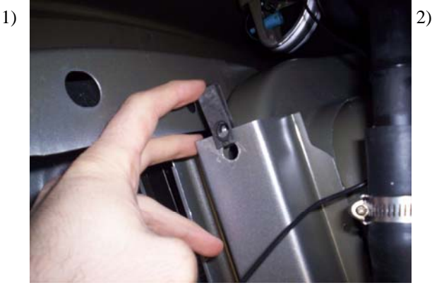
Locate the front bed cross member and install clip nut as shown in Fig. 1 . If no hole is present you will have to drill a 1/2" hole and insert 8mm pull nut as shown in Fig. 4