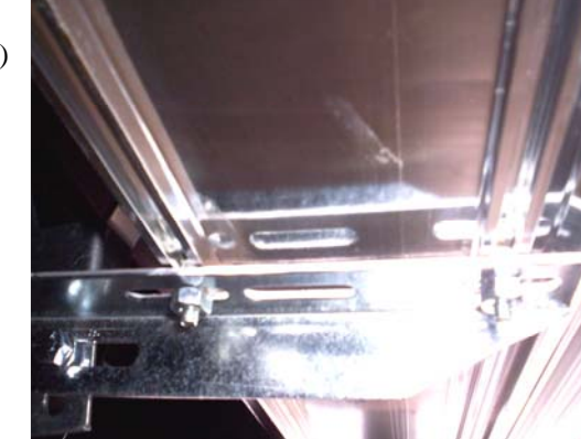
Place the board on the brackets with the bolts through the slots. Fasten with 1/4" nuts. Note: riser of box board tucks behind bedside in order to line up with 2" riser of cab board.