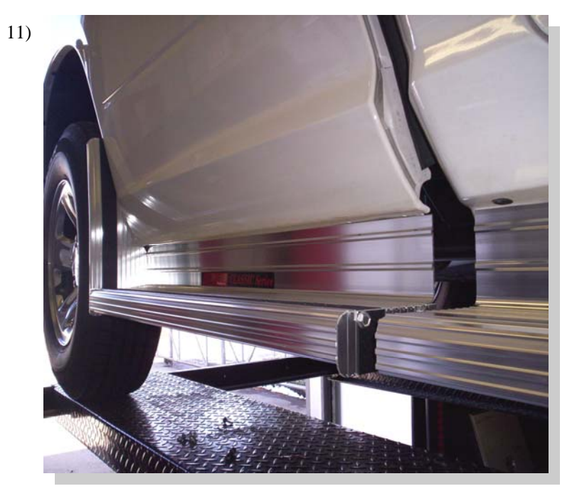
Tighten any and all loose bolts. Repeat all steps for opposite side.

2007–C Chevy/GMC FS PU OC7438EX, OC7438EXB OC8438EX, OC8438EXB