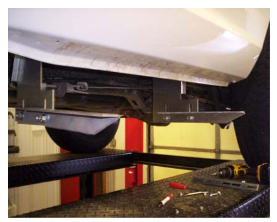
Attach a 3124F angle bracket to the FL181 and FL180D & P with 5/16" bolts and nuts. Snug but do not tighten at this time.