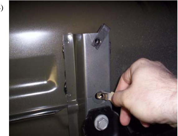
In front of rear wheel, above front leaf spring shackle, on the bed cross member, attach clip nut and 8mm pull nut, as shown in Fig. 4 .