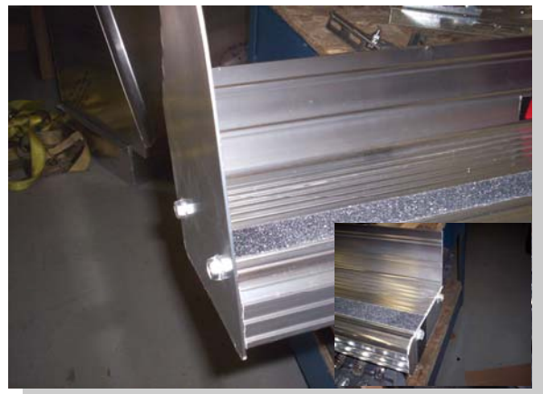
Attach stone guard and end cap to running board using 3/8"self threading bolts.

Insert one square headed track bolt into both tracks for each bracket.