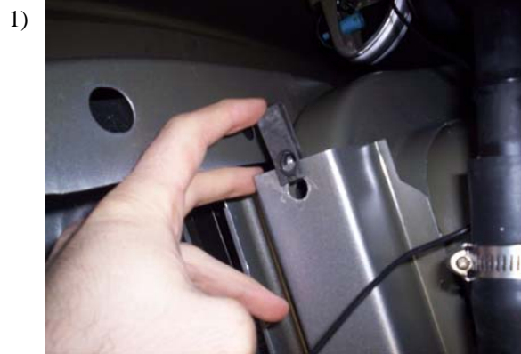
Locate the front bed cross member and install clip nut as shown in Fig. 1 .