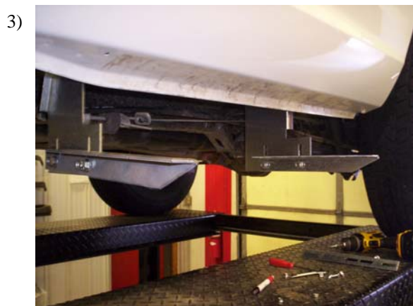
Attach a 3124F angle bracket to the FL221 bracket with 5/16" bolts and nuts. Snug but do not tighten at this time. Picture shows long bed with extra bracket not needed in short bed.