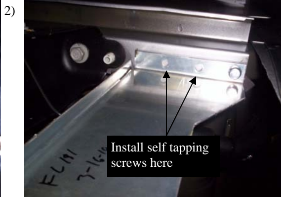
Attach the FL221 bracket to the front bed cross member support, using 5/16" bolt, as shown in Fig. 2 . Next install self tapping screws into the other holes in the bracket to the cross member.