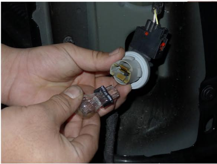
5. Remove thr brake light bulb