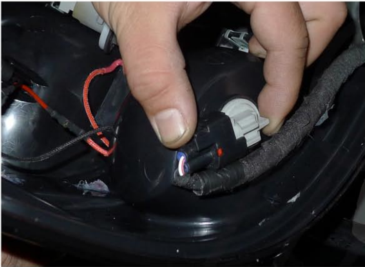
7. Connect the brake light harness to the LED taillight