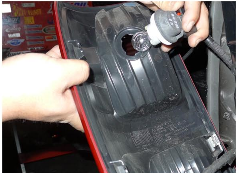
4. Remove the taillight sockets