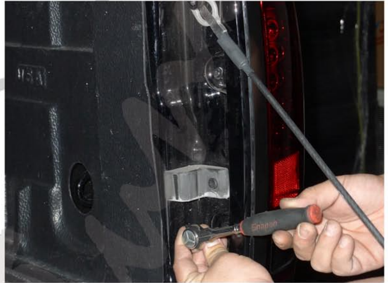
2. (2) T15 screw locations and remove the (2) T15 screw