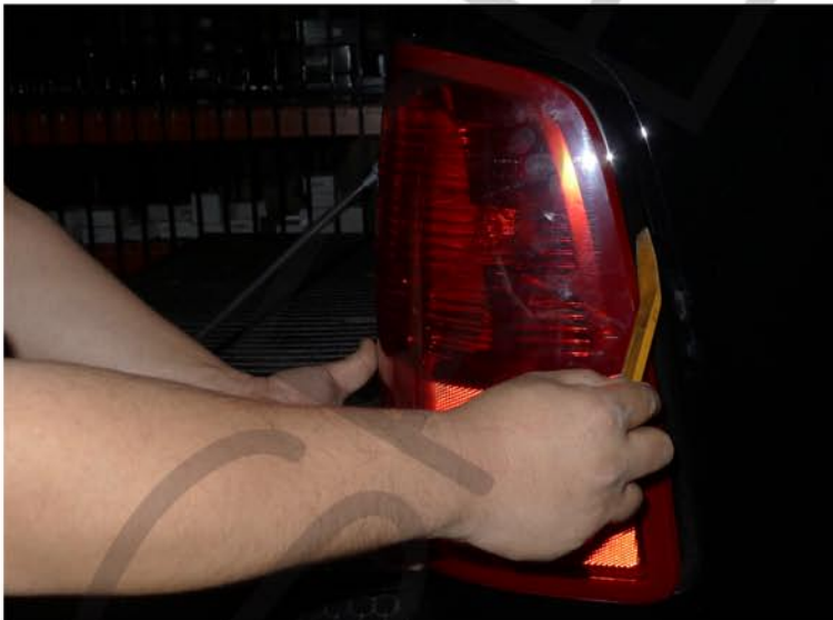
3. Remove the factory taillight