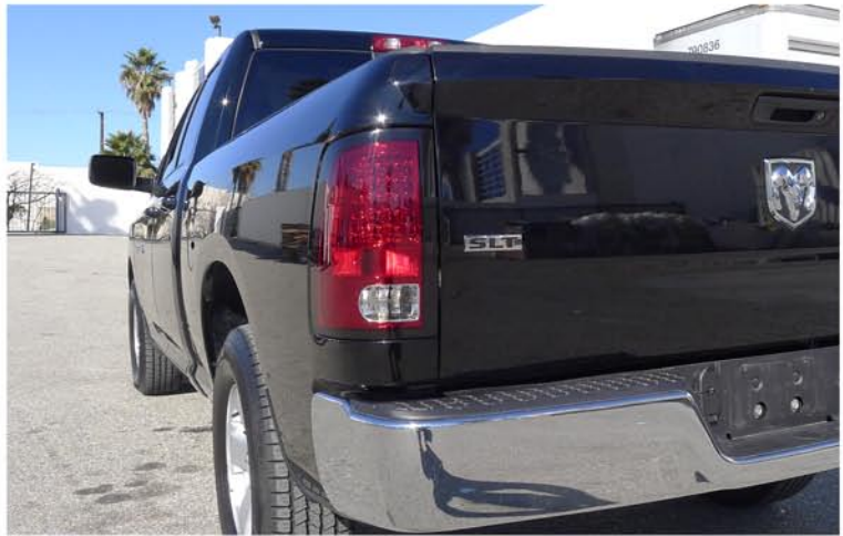
10. Please repeat the steps in order from 1 to 9 for the opposite side. The installation is now complete