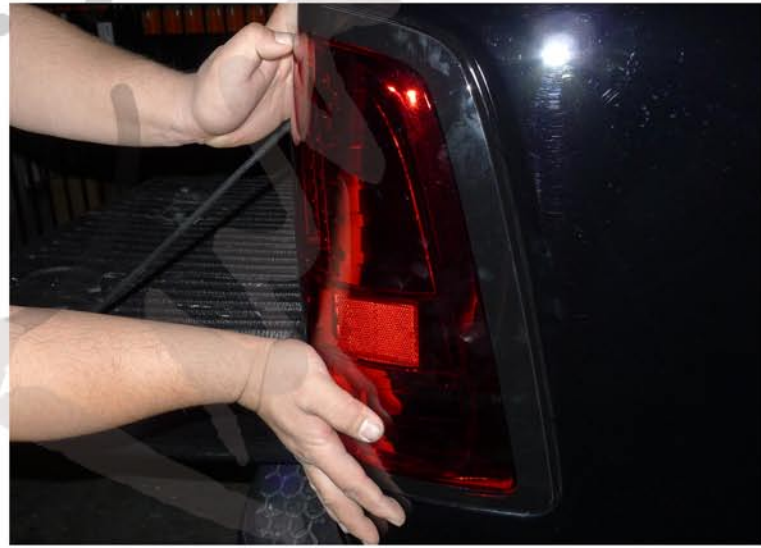
8. Place the LED taillight in the stock location