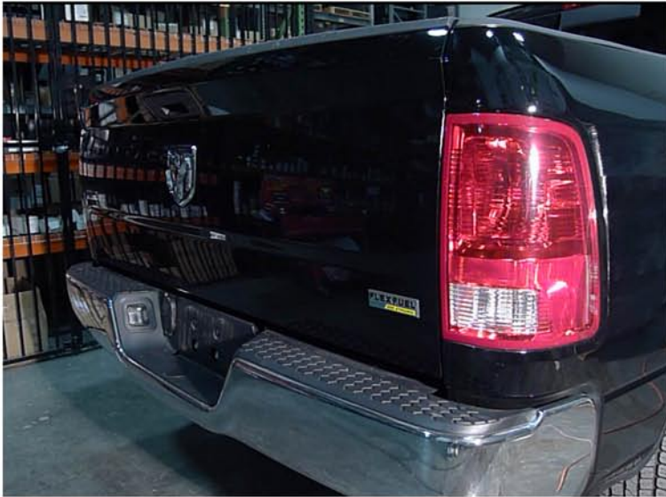
1. Stock light