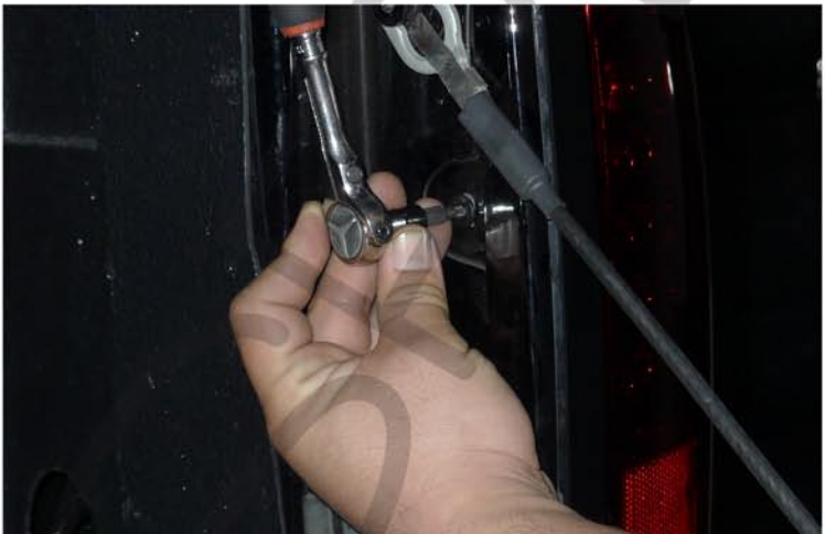
9. Tighten the (2) T15 screws