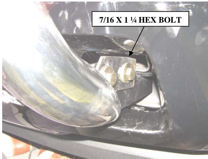
Fig 3 ( Driver Side)