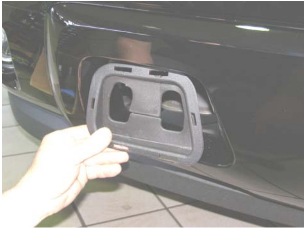
Fig 1 (Passenger Side)

7/16 X 1 1/4" HEX BOLT ( BACK END HOLE )