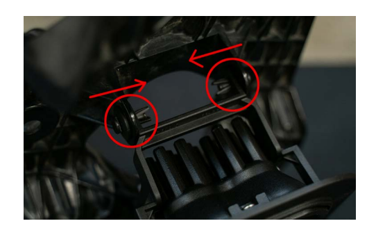
7. Install the Type SD bracket onto the factory foglight bracket, by reinstalling the plastic push rivets.

NOTE: The 3rd mounting point will be used for aiming.