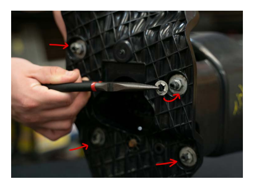
10. Reattach the metal retaining washers.