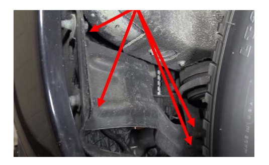
1. Remove the metal brace to gain access to the foglight bracket assembly. Use a 13mm socket and ratchet to remove the four bolts shown above.