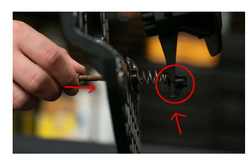
8. Reinstall the adjustment screw, spring, and plastic clip to the bottom of the bracket.