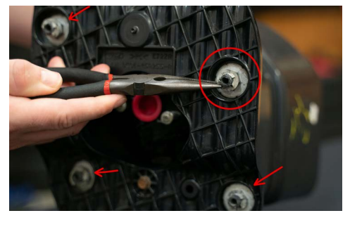
3. Set the foglight bracket assembly on a table. Remove the four metal retaining washers using a pick or flathead screw driver. Then remove the four 13mm nuts that secure the front bezel to the foglight bracket.