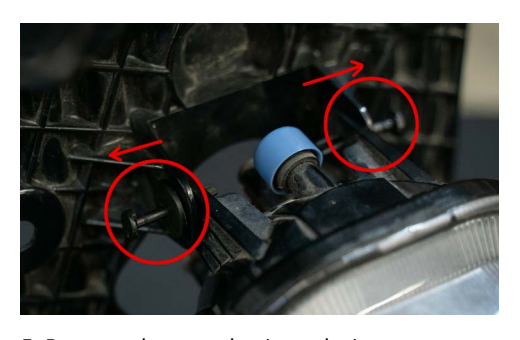
5. Remove the two plastic push rivets shown above that secure the OEM lamp onto the foglight bracket using a trim removal tool (or flat head screw driver).

The adjustment screw, spring, and plastic clip will be reused.