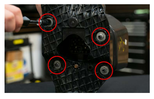
9. Reattach the front bezel using the four 13mm nuts. Do not over tighten.