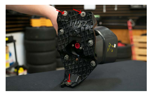
2. With the metal brace removed you can remove the entire foglight bracket assembly by removing the three 8mm bolts shown above.