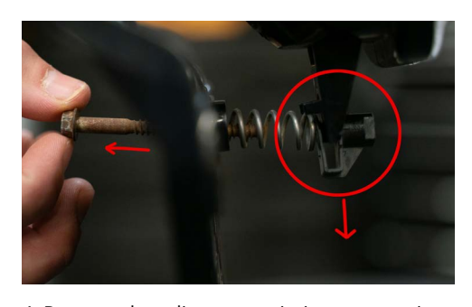
4. Remove the adjustment aiming screw using an 8mm socket.

The adjustment screw, spring, and plastic clip will be reused.