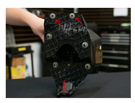
11. Reinstall the entire foglight bracket back onto the vehicle using the three 8mm bolts.