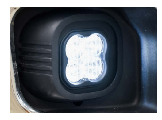
12. Use the included wire adapters to connect the pod to the vehicle wiring harness. Test function. If the light does not turn on, try flipping the connector 180°.

If you purchased backlit SS3 pods, connect the backlight power wire to a fused 12V source to trigger the backlight feature (i.e. parking light or sidemarker); T-Taps are included for this purpose. Check local laws and regulations for on-road use of backlight feature.