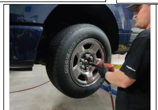
Lift vehicle securely and remove wheels/tires.