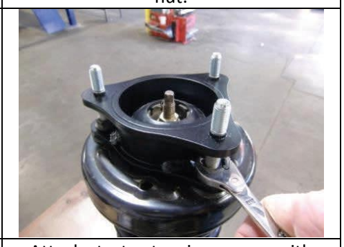
Attach strut extension spacer with GOLD Flange Nuts tighten.