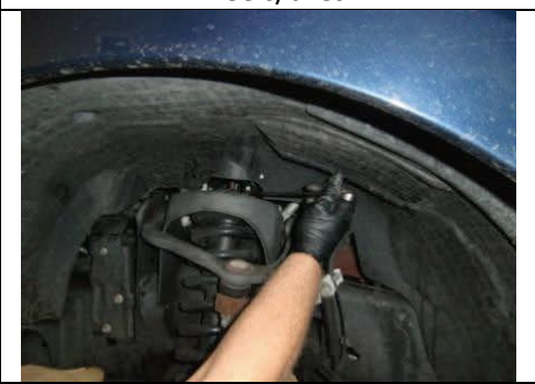
Loosen upper strut mount nuts.