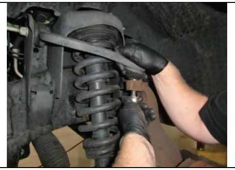
Pull down and remove upper ball joint nut.