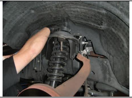
Remove top strut mount nuts and remove assembly.