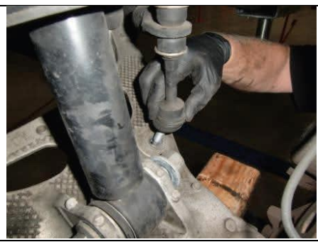
Reconnect lower sway bar end links and torque to spec.

Install wheels and torque to spec., measure and align.