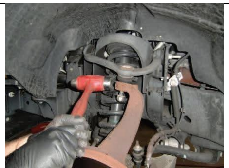
Carefully strike spindle as shown to separate ball joint.