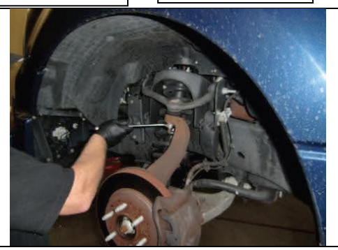
Loosen upper ball joint nut, but do not remove.