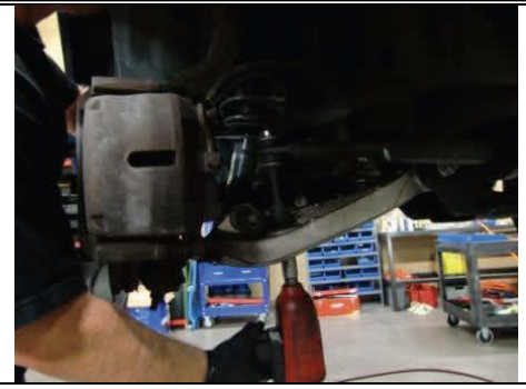
Remove lower sway bar end link hardware.