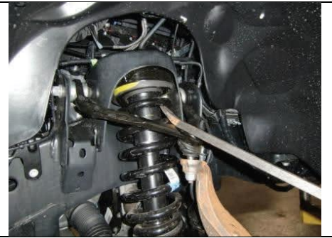
Use jack and pry bar to reattach upper ball joint to spindle.