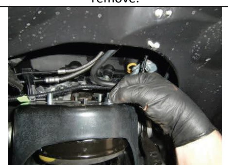
Use SILVER Flange Nuts to re-attach top of strut to vehicle.