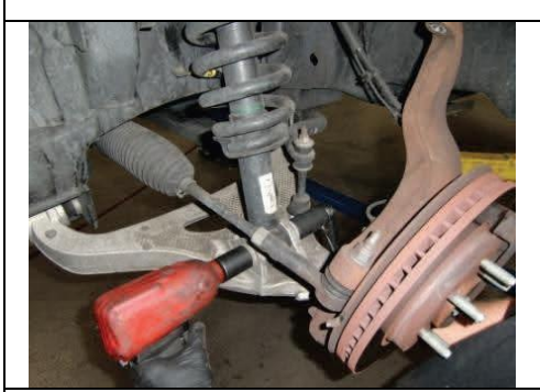
Loosen lower strut bolt/nut and remove.