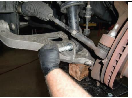
Reconnect lower strut mount and torque to spec.