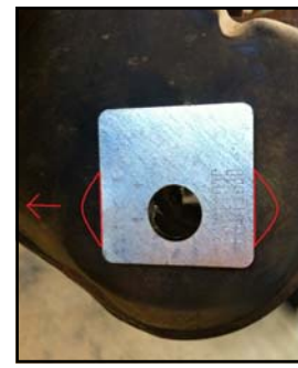
0 degree change from stock. Use like this to weld onto bracket as a repair to a worn out hole