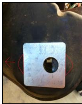
1.5 degree more (positive) caster