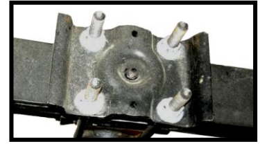
Older model Ford spring

Step 9: Re-check installation to ensure that all a/c lines, brake cables and truck frame will not interfere with the vertical travel of the SuperSprings.