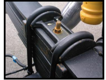
2011~present Ford spring