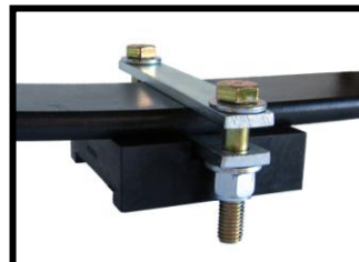
P5KT Ford F450/550 all models