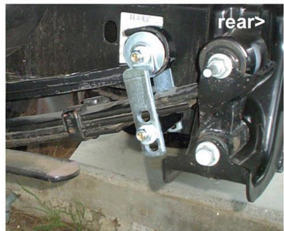
Adjustable pre-load and ride height [fnt/rear]

Refer to SuperSprings application guide for part selection www.supersprings.com [Tech line #866-898-0720] SuperSprings enhance load carrying capability, handling & towing. Never exceed vehicle manufacturer's GVWR rating.