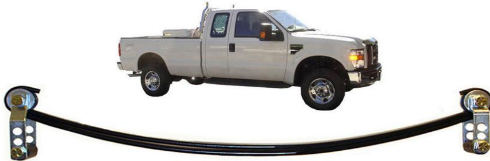
Poly Spring Pad PSP-7

Ford F-250 F-350 Super Duty [2008 ~ 2010] without factory top overload SuperSprings Part# SSA10 ~ SSA15 with PSP-7