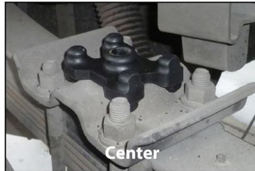
PSP7 mounted on factory spring plate