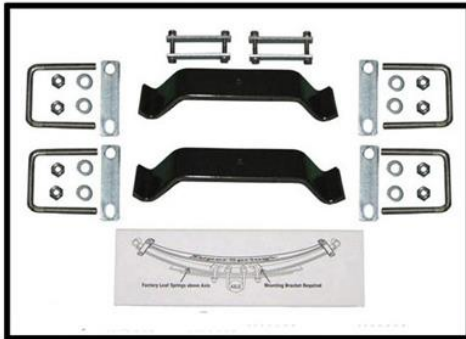
SuperSprings Mounting Kit # MTKT Installed →