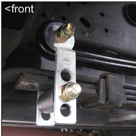
front ~ spring eye bolt threads out