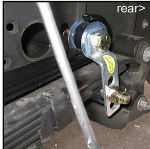
front & rear ~ adjustable preload

Refer to SuperSprings application guide for part selection www.supersprings.com [Tech line #866-898-0720] SuperSprings enhance load carrying capability, handling & towing. Never exceed vehicle manufacturer's GVWR rating.