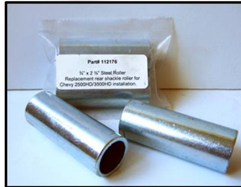
Replacement rear shackle roller for GM 2500/3500 HD installation (inside SSA15 box)