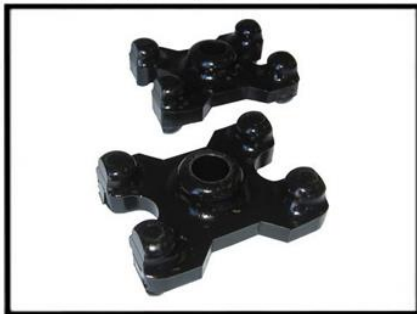
Polyurethane Mounting Base