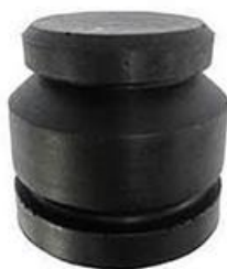
Front SumoSprings SSF-202-47 uninstalled

SSF-202-47 Installation (actual product material is black)