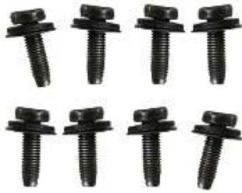
Uninstall the Original Bolts