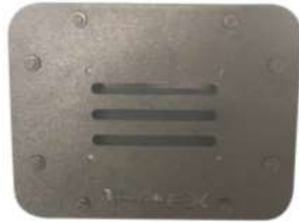
Install the TrailFx Tailgate Vent Cover with the vehicle body with OEM Bolts