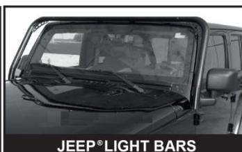
JEEP® LIGHT BARS