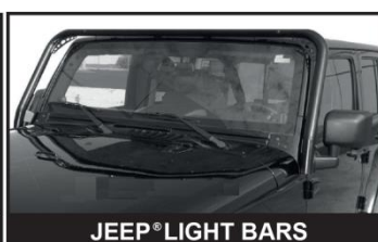
JEEP® LIGHT BARS