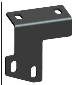
Driver/left Mounting Bracket