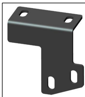
Passenger/right mounting Bracket