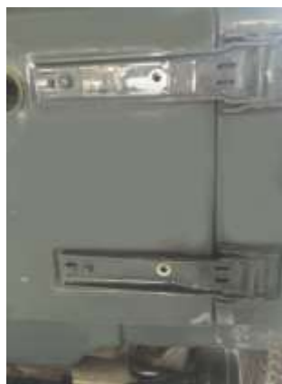
Remove the OEM Screws