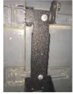
Connect mounting bracket with the car body and tighten with one outside hexagon bolt, M10 flat washer and one circular tube.