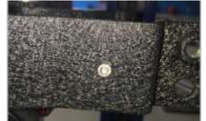
Install the block rubber on mounting bracket and upper mounting plate with Round head bolt of a cross and nut, respectively.