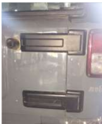
Remove the OEM Decorative Cover