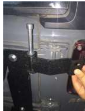
Install the mounting bracket on upper mounting plate and tighten with Cylinder head hex socket bolt and flat washer