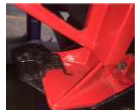
Place the jack on mounting bracket and fixed with under mounting plate, handle nut and Non-slip gasket.