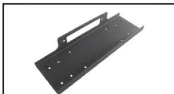
MOUNTING PLATE - UNIVERSAL