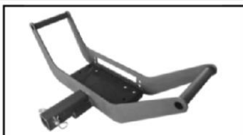
MOUNTING PLATE - CRADLE