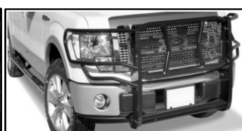
HD GRILLE GUARDS