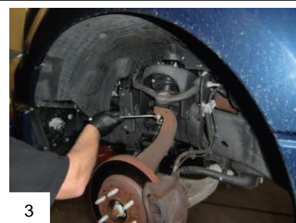
3 Loosen upper ball joint nut, but do not remove.