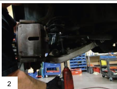
2 Remove lower sway bar end link hardware.