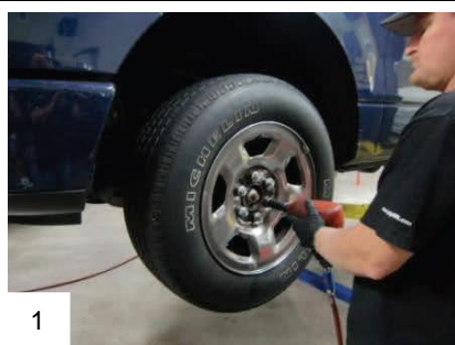
1 Lift vehicle securely and remove wheels/tires.