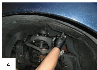
4 Loosen upper strut mount nuts.