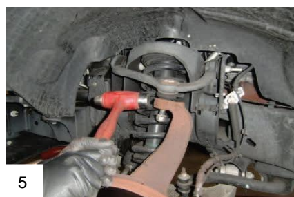
5 Carefully strike spindle as shown to separate ball joint.