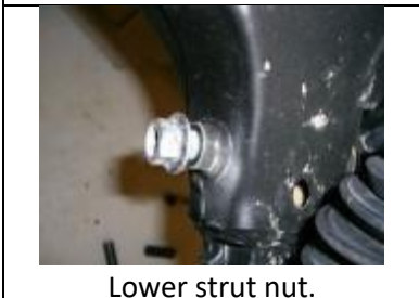
Lower strut nut.

Using a 19mm socket, loosen and remove the sway bar end link bolt on the lower control arm.