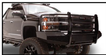
FULL FRONT REPLACEMENT BUMPER