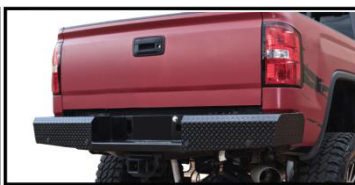
REAR REPLACEMENT BUMPER