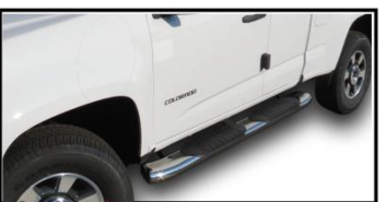
6" OVAL BENT STEP BAR

Keystone Automotive Operations Inc. (KAO) warrants this product to be free of defects in material and workmanship at the time of purchase by the original retail consumer. KAO disclaims any other warranties, express or implied, including the warranty of fitness for a particular purpose or an intended use. If the product is found to be defective, KAO may replace or repair the product at our option, when the product is returned prepaid, with proof of purchase. Alteration to, improper installation, or misuse of this product voids the warranty. KAO's liability is limited to repair or replacement of products found to be defective, and specifically excludes liability for any incidental or consequential loss or damage.