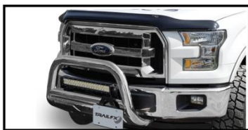
3.5 INCH OVAL BULL BAR