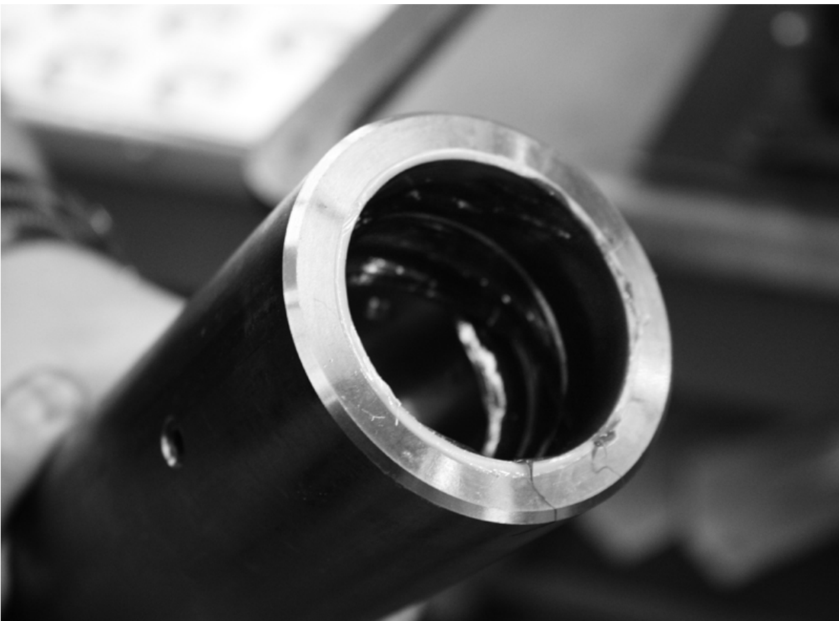
Apply a liberal amount of bearing grease to the boring tool threads.