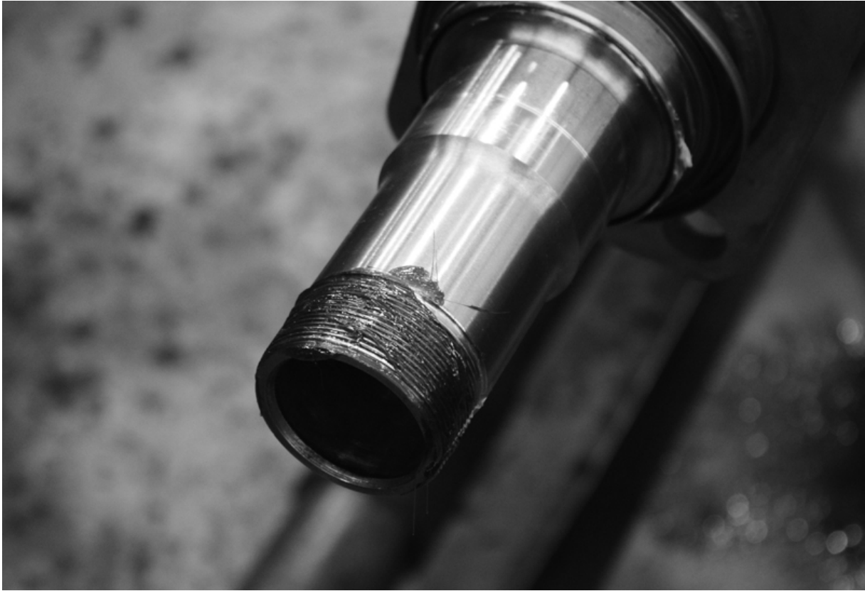
Apply a liberal amount of bearing grease to the spindle threads.